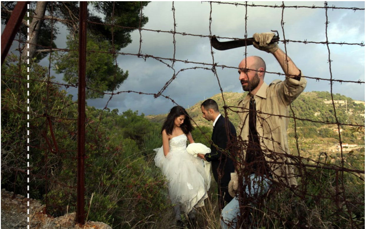
The bride and the groom passing the border between Italy and France

This film is about what happened on the road from Milan to Stockholm on 14th-18th November 2013.