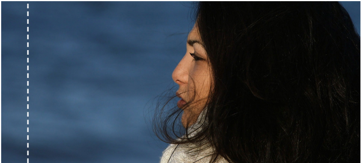
The bride in front of the sea in Copenhagen, just before the last border crossing

A Palestinian poet and an Italian journalist meet five Palestinians and Syrians in Milan who entered Europe via the Italian island of Lampedusa after fleeing the war in Syria. They decide to help them complete their journey to Sweden – and hopefully avoid getting themselves arrested as traffickers – by faking a wedding. With a Palestinian friend dressed up as the bride and a dozen or so Italian and Syrian friends as wedding guests, they cross halfway over Europe on a four-day journey of three thousand kilometres.