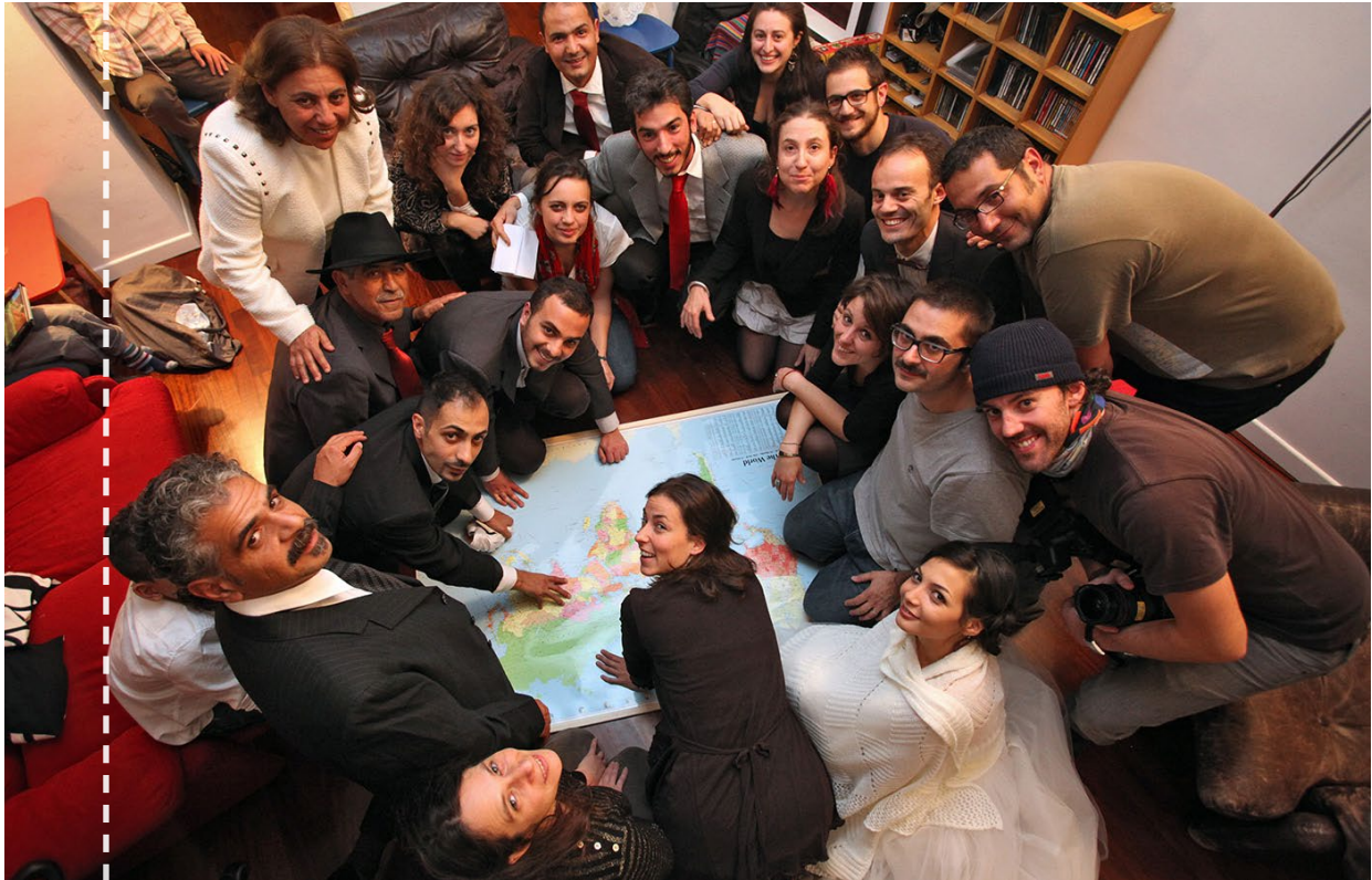
The group in Milan, the night before the departure